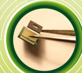
STACKED LENS ON PACKAGE